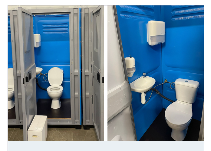
Mobile sanitairy unit