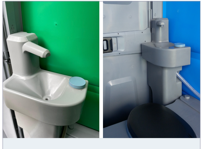
Hand wash basin