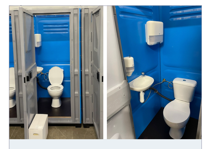
Mobile sanitairy unit